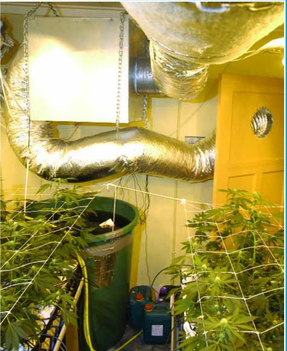
A carbon filter and ozone exchange box dominate the landscape in this Dutch grow room.