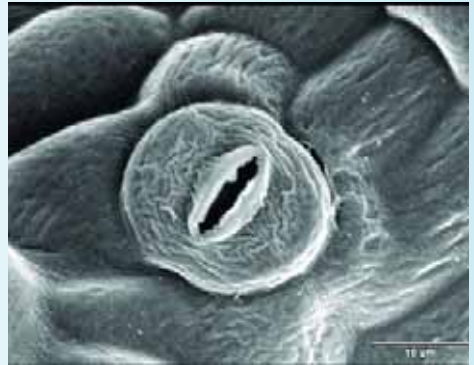
This photo of a half-opened stomata, the mouth-like opening on leaf underside, was magnified 2500 times.

Stomata are microscopic pores on leaf undersides that are similar to an animal's nostrils. Animals regulate the amount of oxygen inhaled and carbon dioxide and other elements exhaled through the nostrils via the lungs. In cannabis, oxygen and carbon dioxide flows are regulated by the stomata. The larger the plant, the more stomata it has to take in carbon dioxide and release oxygen. The greater the volume of plants, the more fresh CO 2 -rich air they will need to grow quickly. Dirty, clogged stomata do not work properly and restrict airflow. Stomata are easily clogged by dirt from polluted air and sprays that leave filmy residues. Keep foliage clean. To avoid clogging stomata, spray foliage with tepid water a day or two after spraying with pesticides, fungicides or nutrient solution.