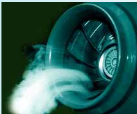
Smoke is immediately sucked out of the room when using this in-line fan. The fan demonstration took place at the 2000 CannaBusiness trade show in Germany.

life. For example, the level of CO 2 in the air over a field of rapidly growing cannabis could be only a third of normal on a very still day. Wind blows in fresh CO 2 -rich air. Rain washes air and plants of dust and pollutants. The outdoor environment is often harsh and unpredictable, but there is always fresh air. Indoor gardens must be meticulously controlled to replicate the outdoor atmosphere.