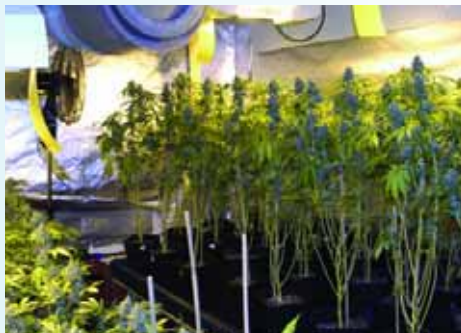
At least one good circulation fan and an extraction fan are necessary in grow rooms. The extraction fan in this grow room is attached to a carbon filter.

Air ventilation and circulation are essential to a healthy indoor harvest. Indoors, fresh air is one of the most overlooked factors contributing to a