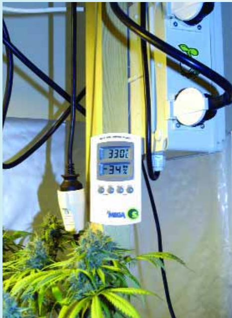
Monitor temperature and humidity regularly. The 86°F (33°C) 34 percent relative humidity conditions make plants use more water and less fertilizer. Adjust irrigation schedule to meet needs.

Fresh air is essential in all gardens. Indoors, it could be the difference between success and failure. Outdoor air is abundant and packed with carbon dioxide (CO 2 ) necessary for plant