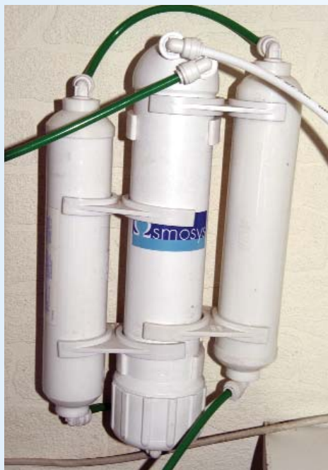
This reverse osmosis machine transforms water with a high ppm or EC into water with less than 10 ppm.

The roots draw the nutrient solution up the plant by the process of osmosis. Osmosis is the tendency of the fluids to pass through a semi-permeable membrane and mix with each other until the fluids are equally concentrated on both sides of the membrane. Semi-permeable membranes located in the root hairs allow specific