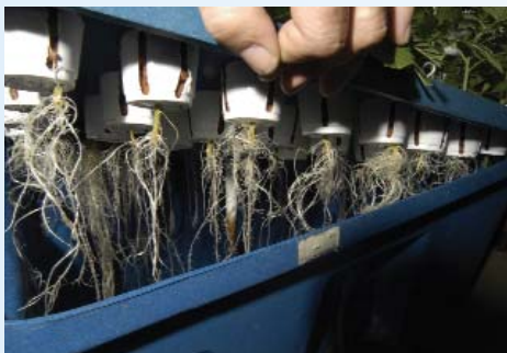
Look at a rooting clone. Check out the fine, fuzzy roots closely. You can see the minute hair-like feeder roots.

The roots support the plants, absorb nutrients, and provide the initial pathway into the vascular system. A close-up look at a root reveals the xylem and phloem core, vascular tissue that is enveloped by a cortex tissue or the layer between the internal vascular and the external epidermal tissue. The microscopic root hairs are located on the epidermal tissue cells. These tiny root hair follicles are extremely delicate and must remain moist. Root hairs must be protected from abrasions, drying out, extreme temperature fluctuations, and harsh chemical concentrations. Plant health and well-being is contingent upon strong, healthy roots.