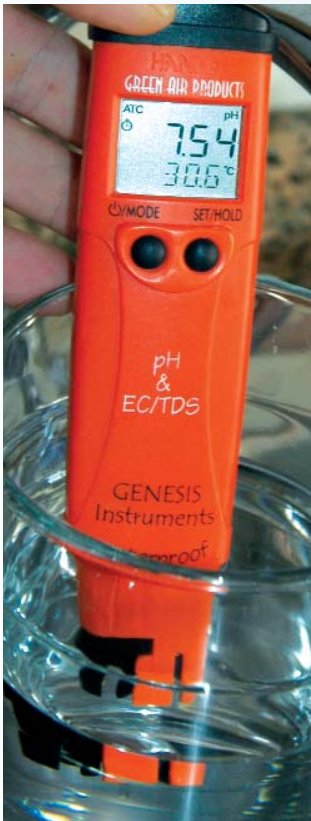
Check the pH of the irrigation water and adjust when necessary.

Simple water filters do not clean dissolved solids from the water. Such filters remove only debris emulsified (suspended) in water; releasing dissolved solids from their chemical bond is more complex. A reverse-osmosis machine uses small polymer, semi-permeable membranes that allow pure water to pass through and filter out the dissolved solids from the water. Reverse-osmosis machines are the easiest and most efficient means to clean raw water.