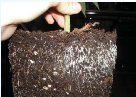
Roots on this clone have reached the wall of the container.

The concentration of calcium (Ca) and magnesium (Mg) indicate how "hard" the water is. Water containing 100 to 150 milligrams of calcium (CaCO 3 ) per liter is acceptable to grow marijuana. "Soft" water contains less than 50 milligrams of calcium per liter and should be supplemented with calcium and magnesium.