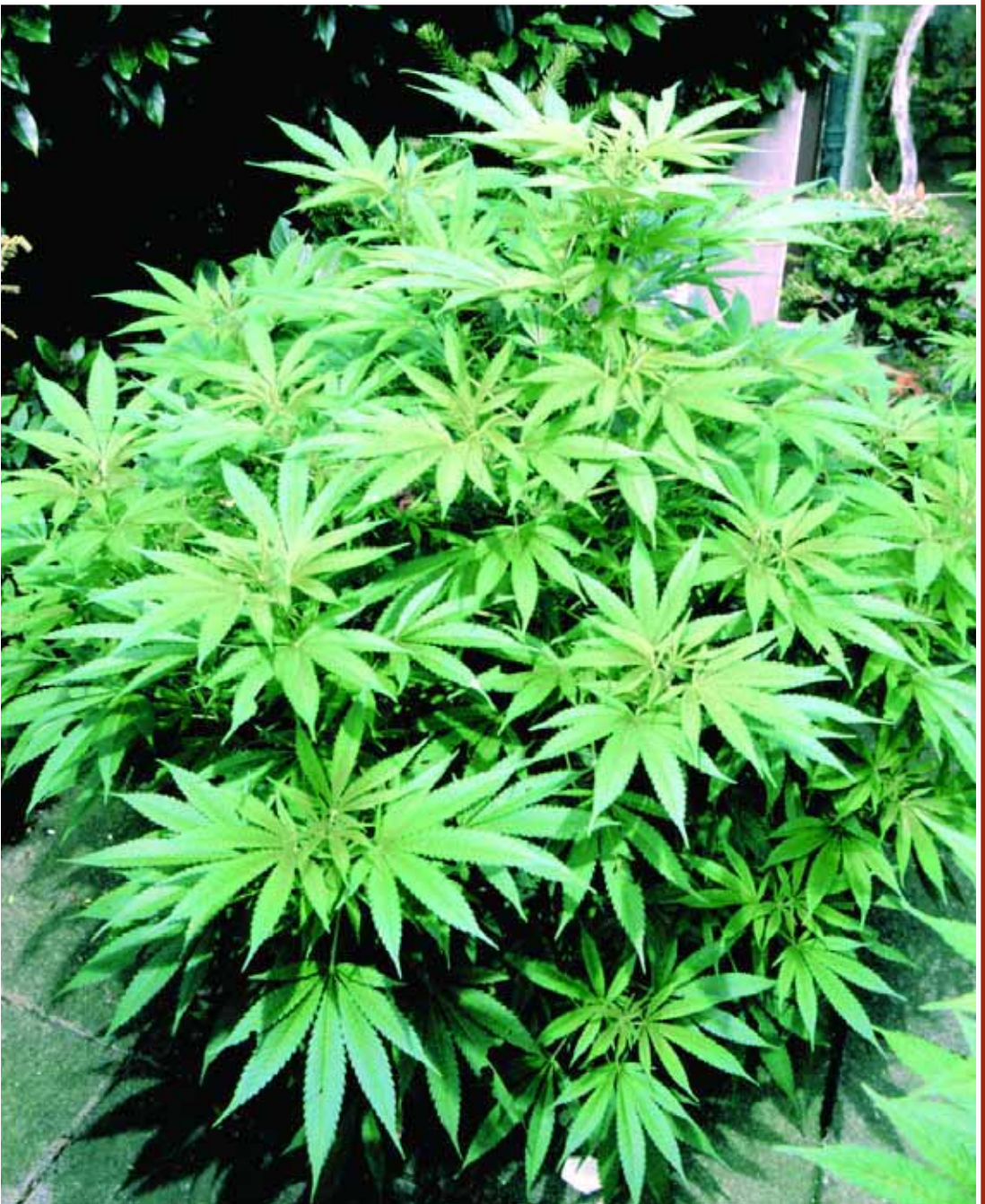
This plant is growing in sandy soil 30 feet (10 m) below sea level in Amsterdam.