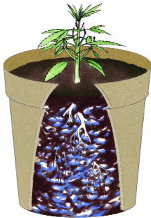
This cutaway drawing shows how the roots penetrate the soil. Note: There must be enough air trapped in the soil to allow biological activity and absorption of nutrients.