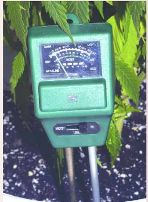
An inexpensive electronic pH tester is easy to use.

Measure the pH with a soil test kit, litmus paper, or electronic pH tester, all of which are available at most nurseries. When testing pH, take two or three samples and follow instructions supplied by the manufacturer "to the letter." Soil test kits measure soil pH and primary nutrient content by mixing soil with a chemical solution and comparing the color of the solution to a chart. Every one of these kits I have seen or used is difficult for novice gardeners to achieve accurate measurements. Comparing the color of the soil/chemical mix to the color of the chart is often confusing. If you use one of these kits, make sure to buy one with good, easy-to-understand directions and ask the sales clerk for exact recommendations on using it.